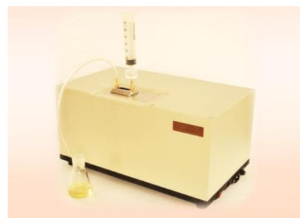
Analyzer on the basis of IR Fourier spectrometer IROS P01 with HATR flow cell